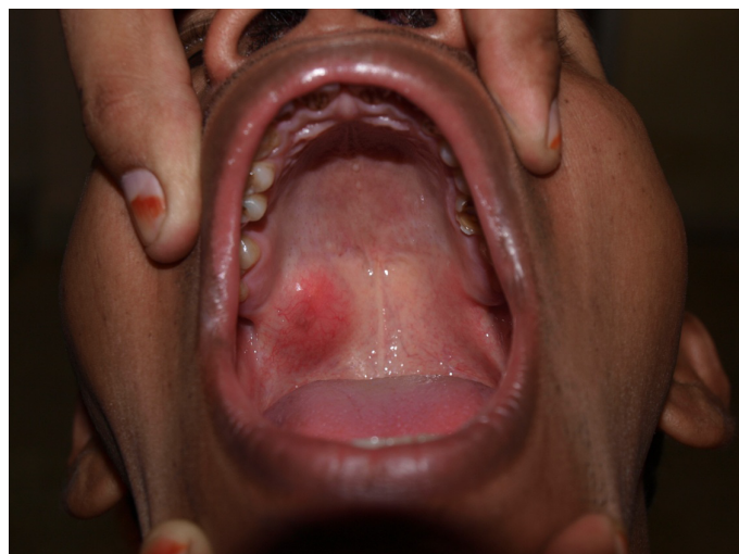
[Table/Fig-1]: A single domed shaped swelling measuring approximately 2 × 3 cms, extending ≈7 mm from marginal gingiva in relation to right first molar to right third molar region, not crossing the midline.

The radiograph of the maxilla (occlusal view) did not show any bony invasion. A computed tomography (CT) scan of the palate was performed by taking 3 mm spiral axial sections and the CT