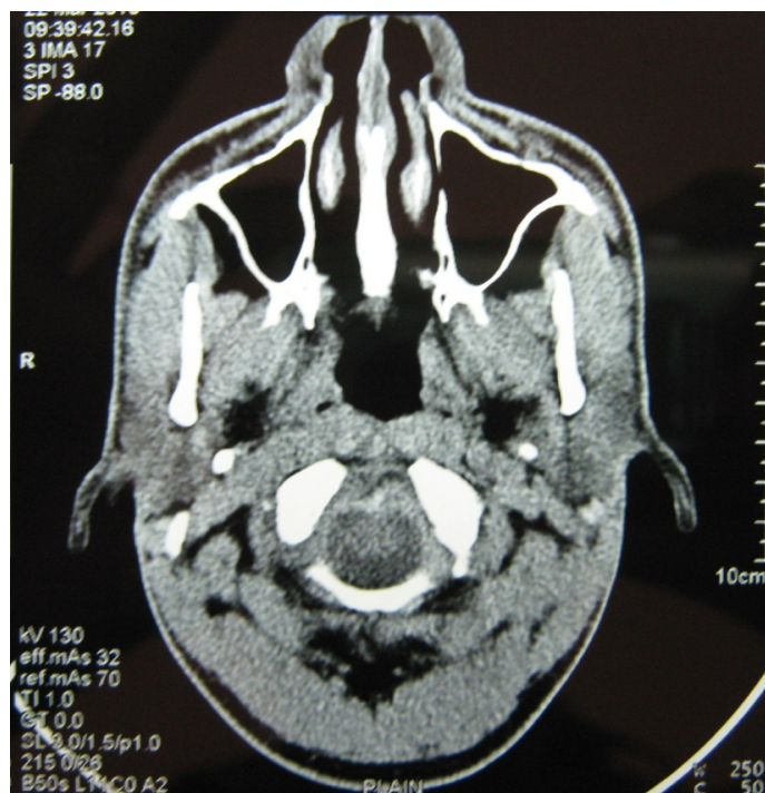
[Table/Fig-2]: Homogenously enhancing well-defined hypodense lesion measuring 2.0 × 2.3 cms in the right posterolateral wall of soft palate with no bony invasion.

Muco-epidermoid carcinoma is the most common malignant salivary gland tumour, while pleomorphic adenoma is its most common benign counterpart. The differential diagnosis for this case includes malignant tumour of the minor salivary gland and lipoma. Plain X-rays and haematologic investigations play no part in the diagnosis of salivary gland tumours of the palate. CT is superior to MRI in evaluating the erosion and the perforation of the bony palate, or the involvement of the nasal cavity or the maxillary sinus. MRI provides a better definition of the vertical and inferior tumour extension and it more accurately indicates the degree of encapsulation [9,10] MRI is also advantageous because of the absence of the exposure to radiation and because of the intravenous contrast